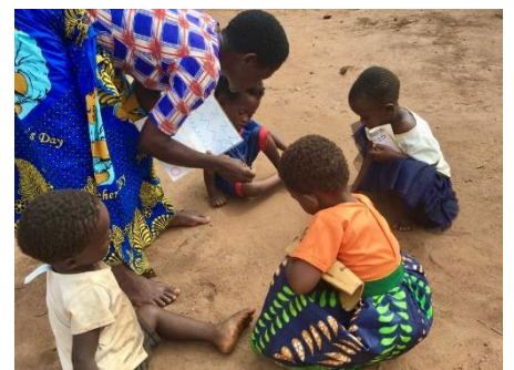
Drawing shapes in the sand