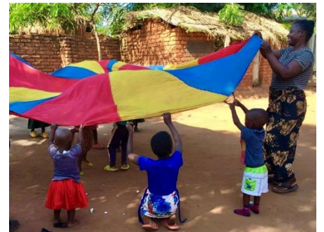
Parachute games with Ethel