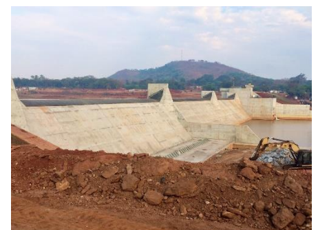
The New Dam