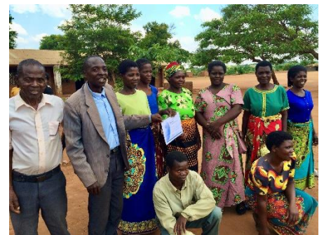
Follow Me graduation