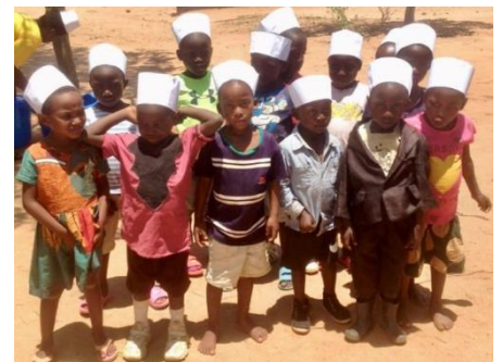
Happy Faces Graduation