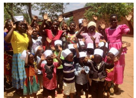
Happy Faces celebrations