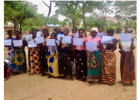
Healthy Home Awards