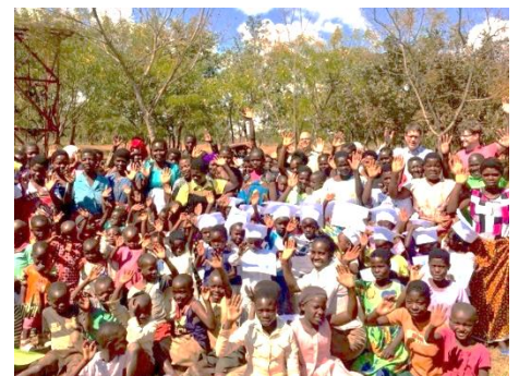
Happy Faces celebrations