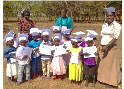
Happy Faces graduates