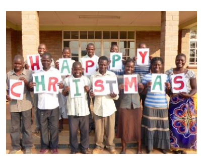
... from all the team!