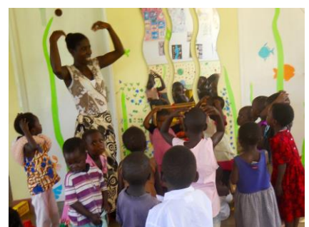
Singing with Rhodess