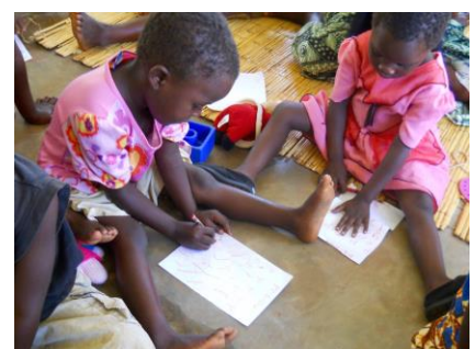
Using the letter P