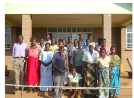
DT team with spouses

Dalitso Trust, 147 Middleton Hall Rd, Birmingham, B30 1AP T: 07851 110297 DalitsoTrust.org Charity No 1090274