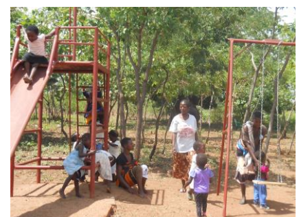
Happy Faces outside play