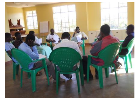
Follow Me 1