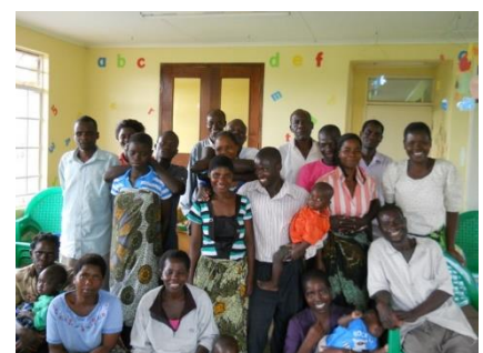
Staff Christmas Meal