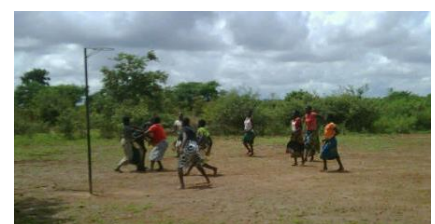
Happy Faces' mums play netball