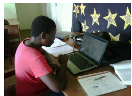
Using our new electricity