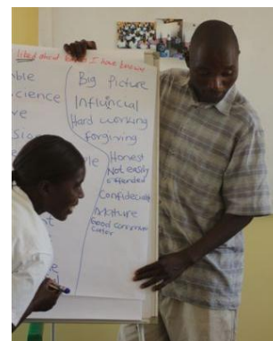
What do we like in leaders we know?

Follow Me; FM2 and FM3 continue to run. We are just about to start work on editing and translating FM4. The rainy season is a challenge as everyone on the courses is a farmer. When the rains come it can make roads impassable and cuts areas off as streams become rivers. We have struggled to get George from Lilongwe due to motorbike problems. The positive side of this has been to see Medson have more responsibility for the courses.